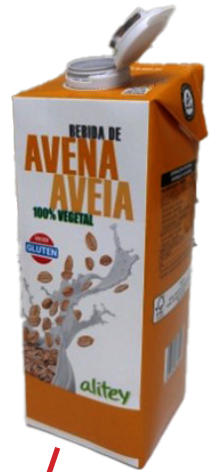
This is a tetrabrik container!

The red text-outline can be used as a model for your heartphone!